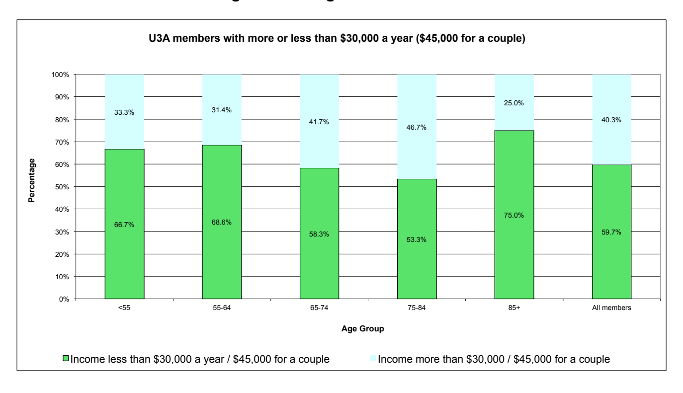
Figure 3: Living on a Low Income

In any repeat of the survey, it might be useful to ask about home ownership, although of course that is a complicating factor: home ownership may reduce some outlays and increase others. Some members are 'asset rich', but have trouble maintaining their properties.